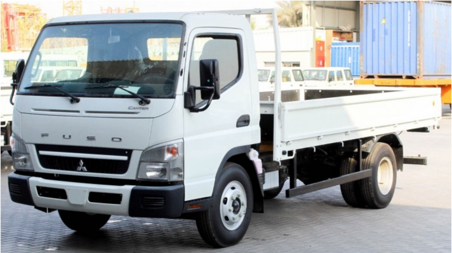
Mitsubishi Canter 4.2 TON MT 2021